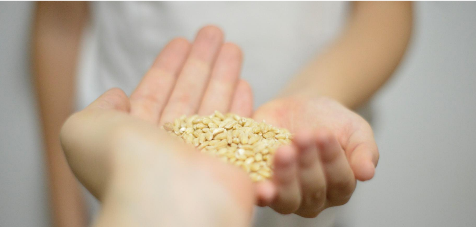
Exhibit at ICC2025

Exhibition will be open 23 September – 25 September 2025. Exhibition will be arranged in the coffee break area to maximize interaction and networking opportunities between participants, exhibitors and sponsors during all coffee and lunch breaks. Additionally, several attractive sponsorship options are offered, some of which have the table top exhibition included in the fee.